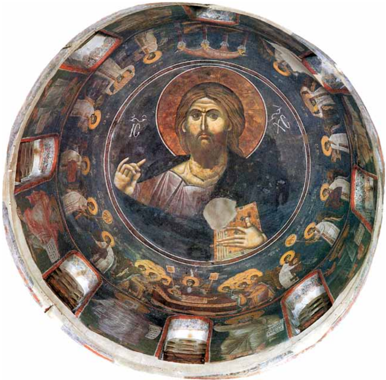
Christ Pantocrator, main dome of the Gračanica, 1318–1321

Gračanica's uniqueness lies in the fact that the icon known as Pantocrator, which inspires liturgical awe, is depicted not just as the God-Man—i.e., God who assumed human nature—but as Co-Man, identifying Himself with man in his suffering and helplessness, with human pain through His suffering on the Cross and His humiliating death. Through His philanthropic gaze, the majestic Pantocrator lowers Himself and meets His creation. The eternal and infinite meets the finite in a particular place and time, within history, where they reconcile within the same fate. This composition, with its wrinkles in the forehead, was not repeated in other Byzantine churches, perhaps because its boldness brought it to the threshold of the psychologization of the divine drama. Gračanica's Pantocrator is truly unique, since it was not copied from anyone. It is original and loving, and for this reason it constitutes a portrait of God, as Christ's wonderfully loving eyes have revealed it to human beings. The riddle of human destiny finds its solution in the Pantocrator's theandric gaze.