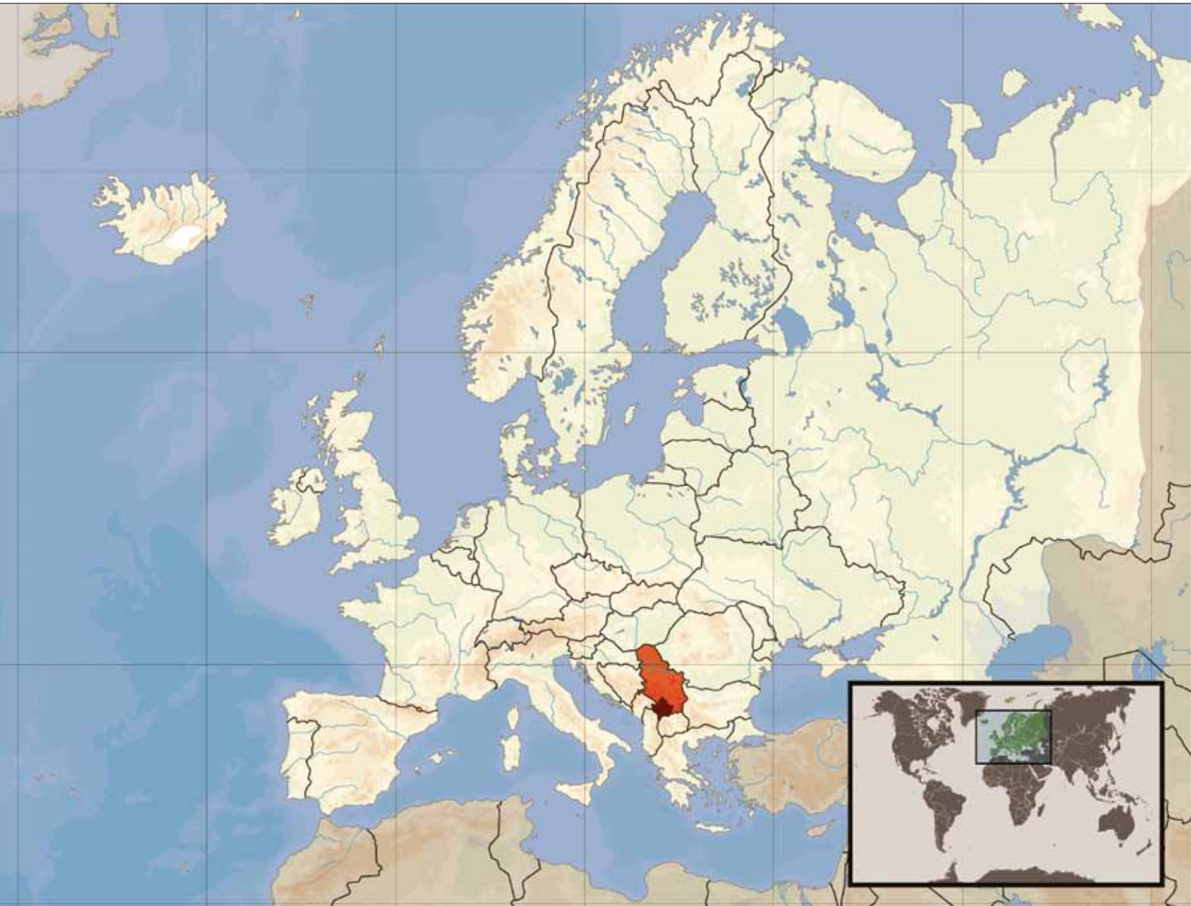
Serbia in Europe, Kosovo-Metohija in Serbia