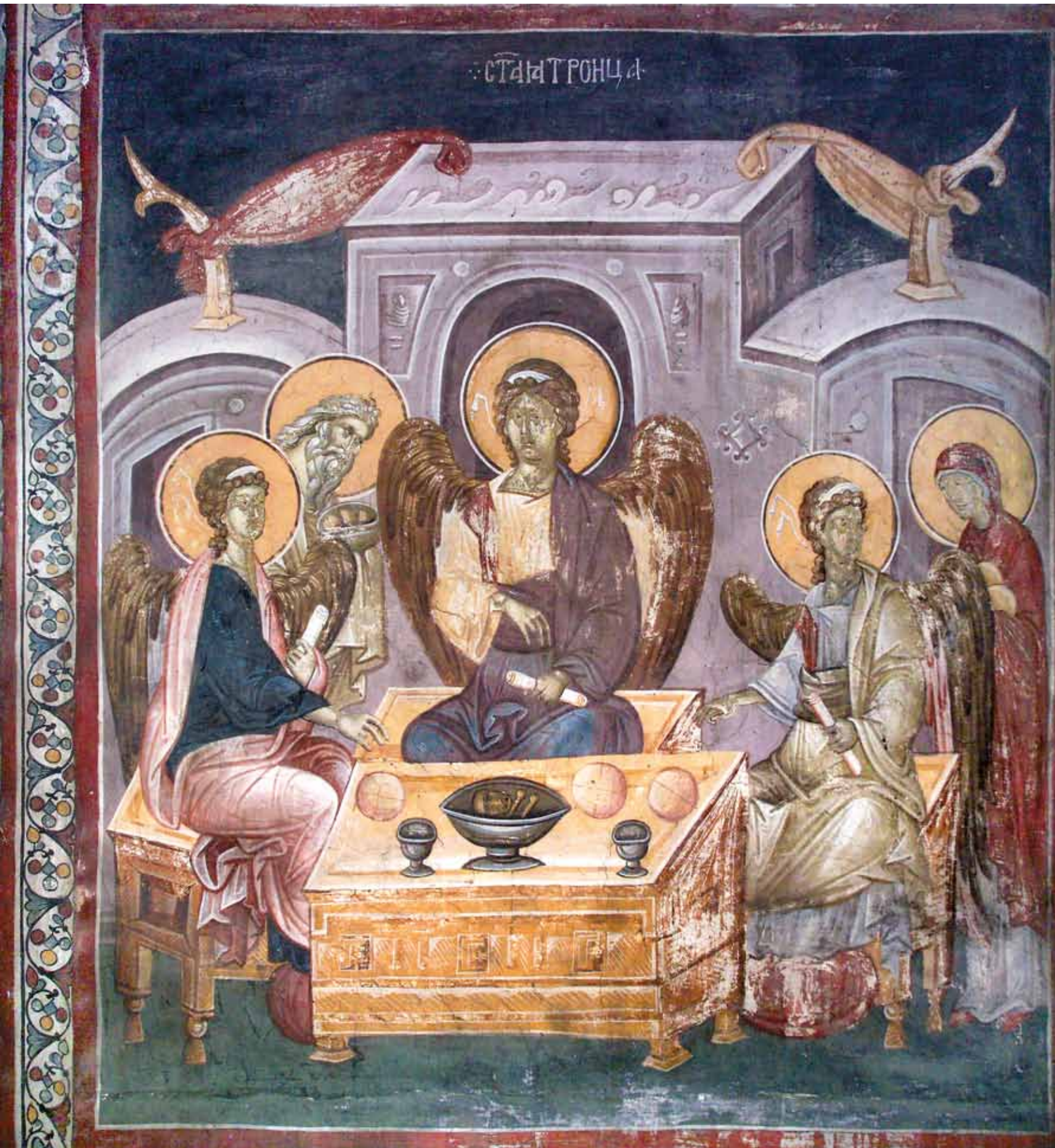
Holy Trinity – Abraham's hospitality, altar, east wall, Gračanica, 1318–1321