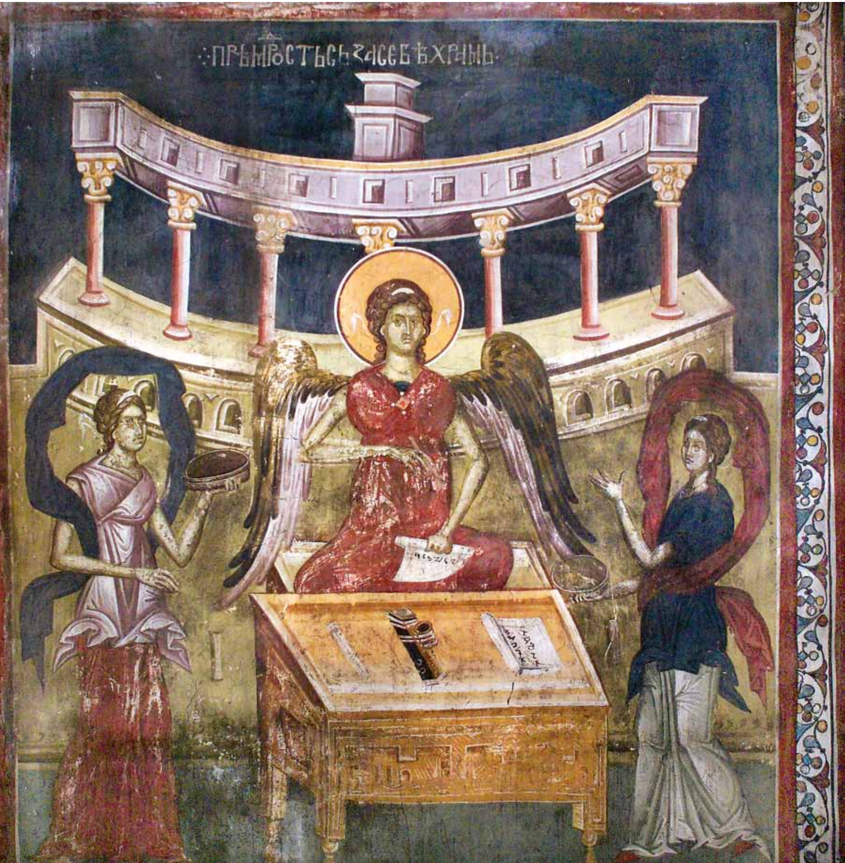
Wisdom has built her house (Proverbs 9:1), altar, east wall, Gračanica, 1318–1321