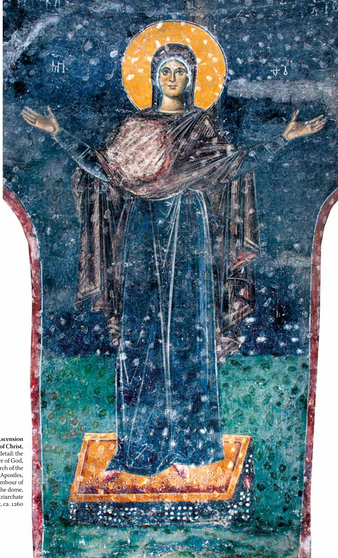
Ascension of Christ, detail: the Mother of God, Church of the Holy Apostles, tambour of the dome, the Patriarchate of Peć, ca. 1260