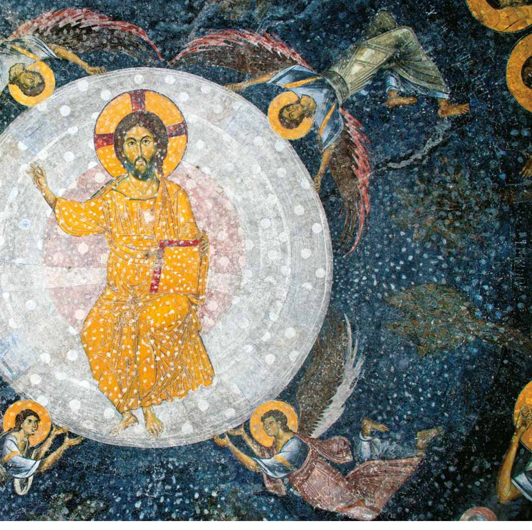
Ascension of Christ, Church of the Holy Apostles, dome, the Patriarchate of Peć, ca. 1260

conduct negotiations, often delicate and long, especially when the possibility of union was being discussed at the papal court.<sup>3</sup> Initiatives of this kind came from both sides