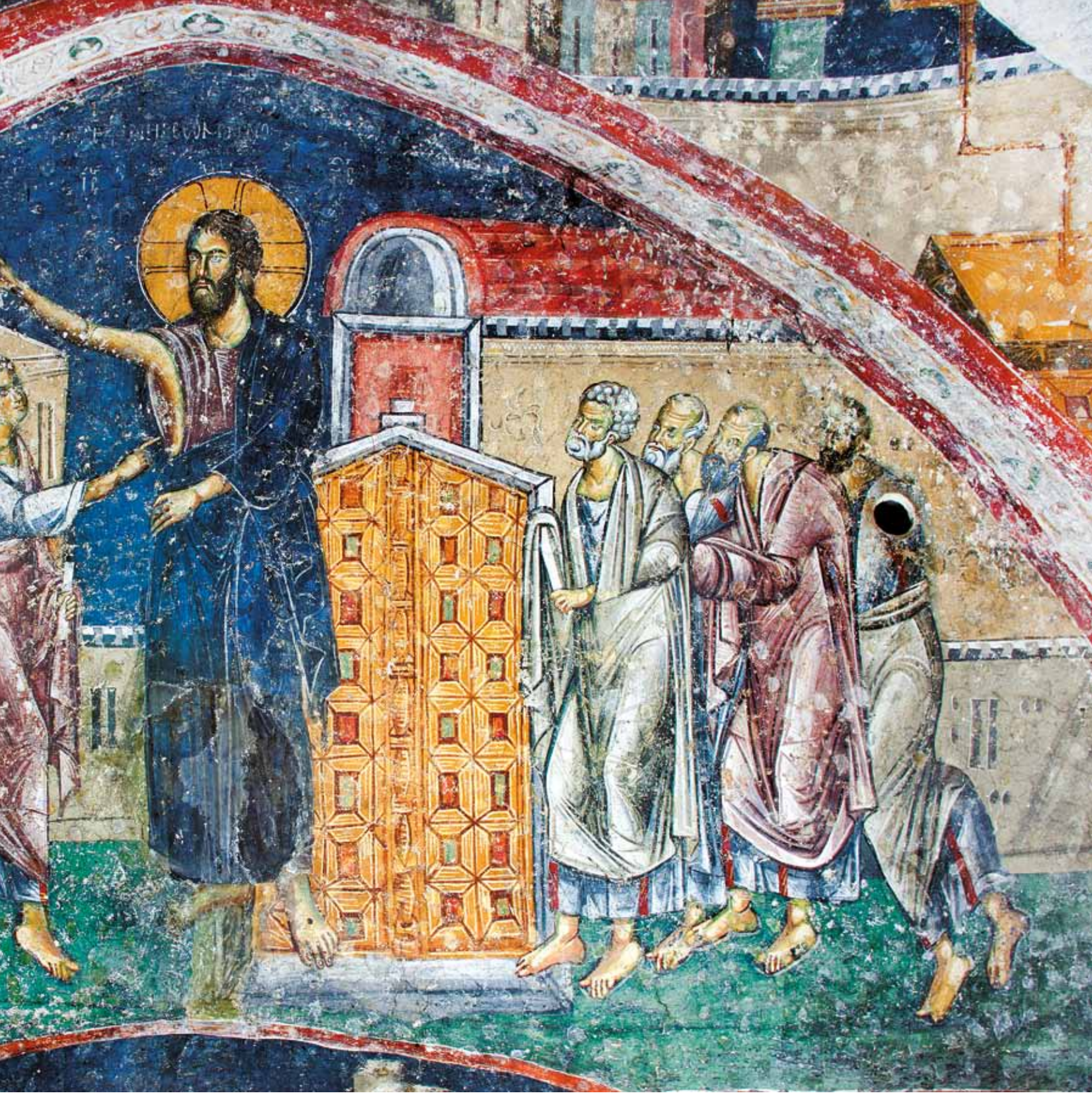
The Incredulity of Thomas, Church of the Holy Apostles, south wall of the naos, the Patriarchate of Peć, ca. 1260

This tangible distinction between the well-preserved churches on the one hand, carefully built in stone, and the ruins of fortified towns on the other, once housing the royal court which were constructed using rather more modest materials, moved an anonymous poet to praise the devotion of rulers who spent their riches on endowed