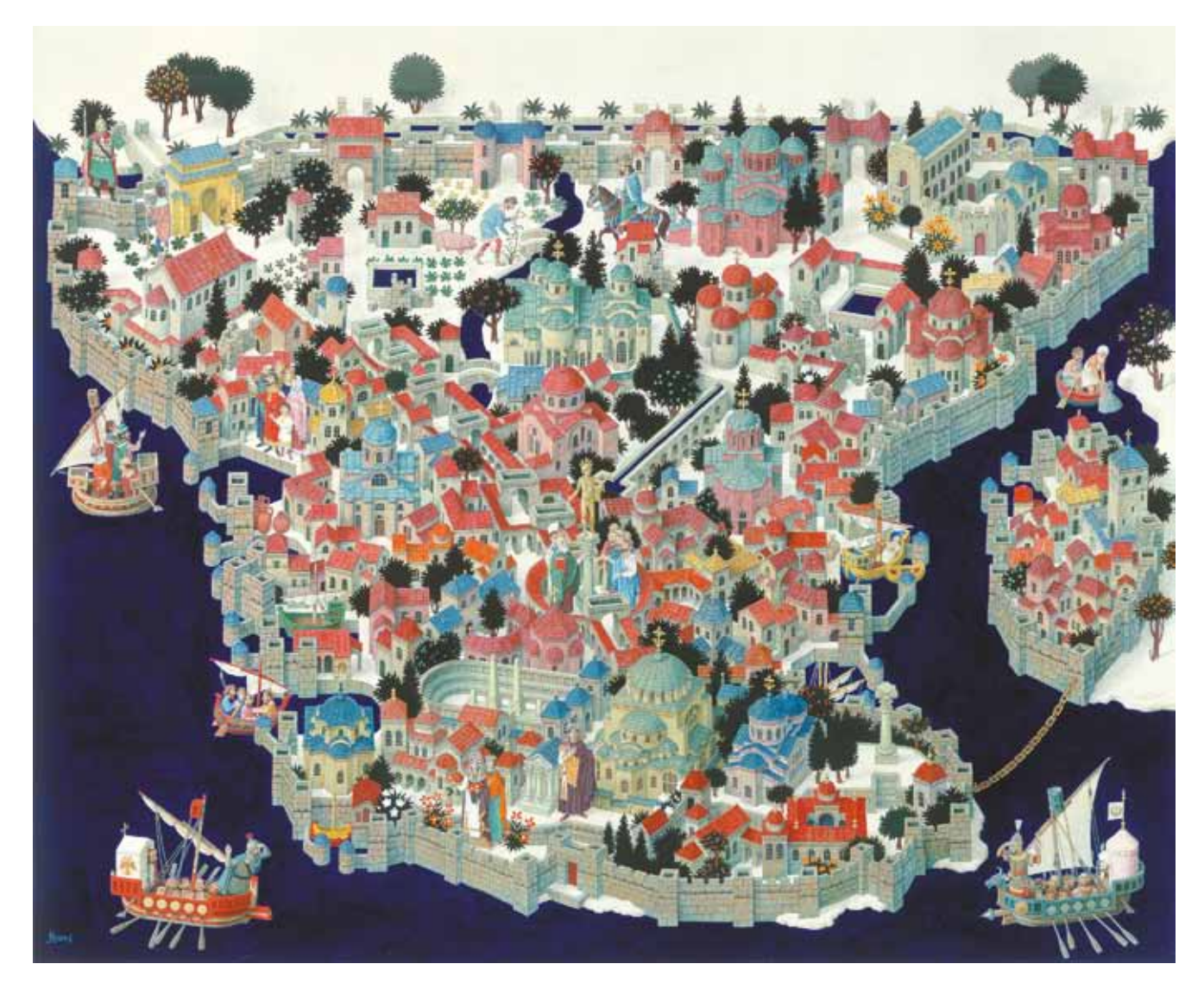
Constantinople—a composite view of the 6<sup>th</sup> to the 11<sup>th</sup> centuries , painting by Jean-Léon Huens (1921–1982), from National Geographic , December 1983

Even when Serbia had fallen under the Ottoman yoke, good artistic work was still produced, although it lacked the brilliance of that done before about 1320. It is the paintings of the earlier period that constitutes the true glory of the Serbian contribution to the story of art.